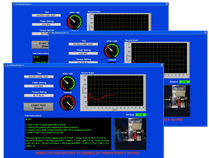
Safe-To-Turn-On Test Screen

New TPSs can be easily added through the use of pre-defined test files and routines.